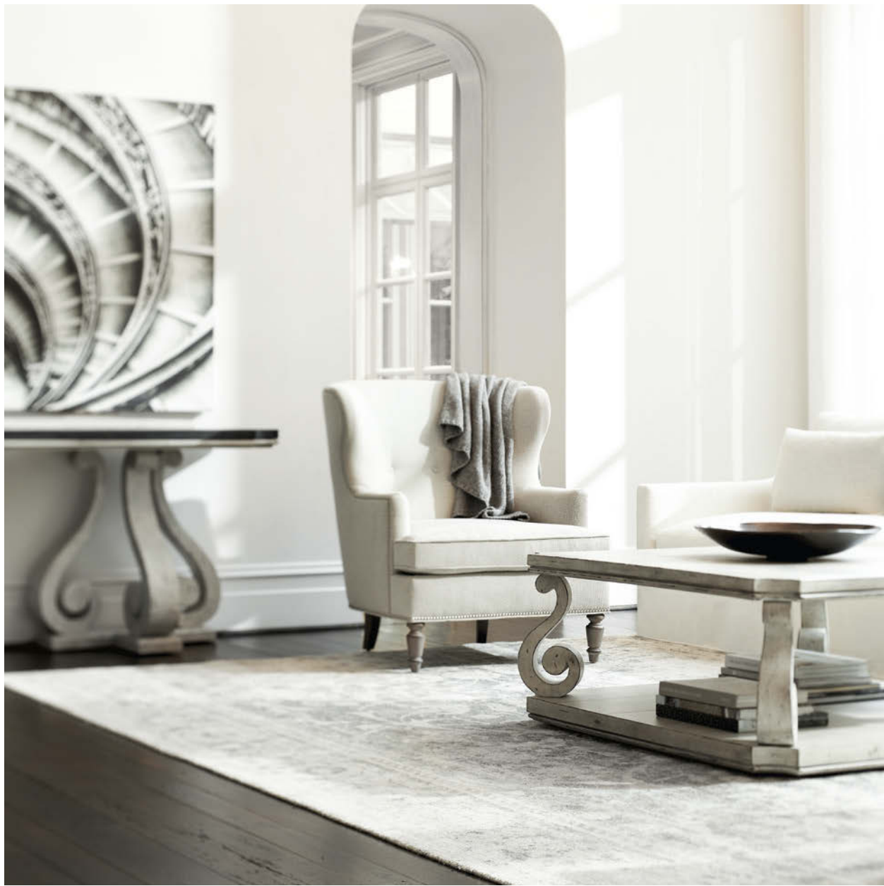
SHOWN: 304-011 Square Cocktail Table 304-121 End Table 304-914C Console Table N2097 Albion Sofa ( Body Fabric 1003-000 ) 212SL Palazzo Chairs ( Leather 352-002 ) N1082 Nadine Chair ( Body Fabric 1682-020 )