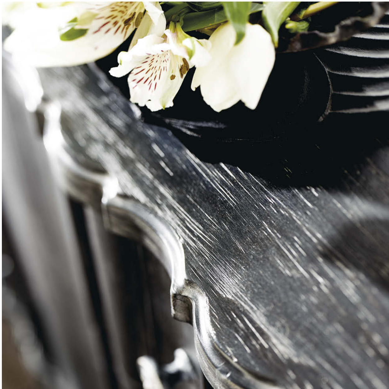
SHOWN: 304-032B Bachelor's Chest 304-H09/FR09 Upholstered Panel Bed 304-506 Metal Bench ( Body Fabric B544 )