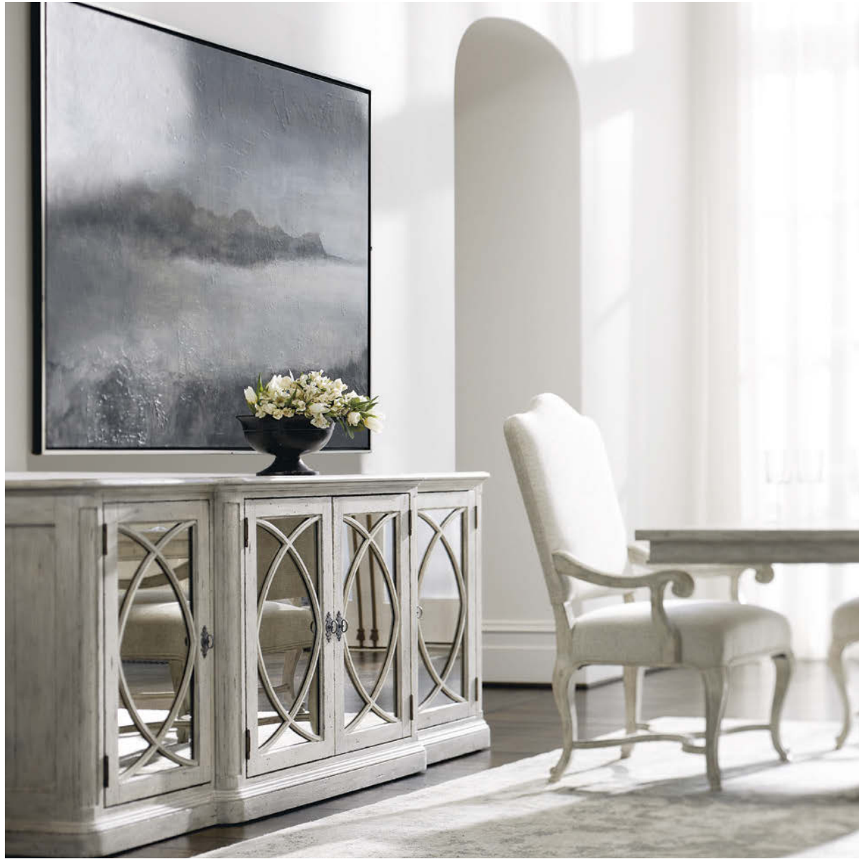
SHOWN: 304-132 Buffet 304-242/304-244 Rectangular Dining Table 304-542 Arm Chair 304-617/304-110 Cabinet