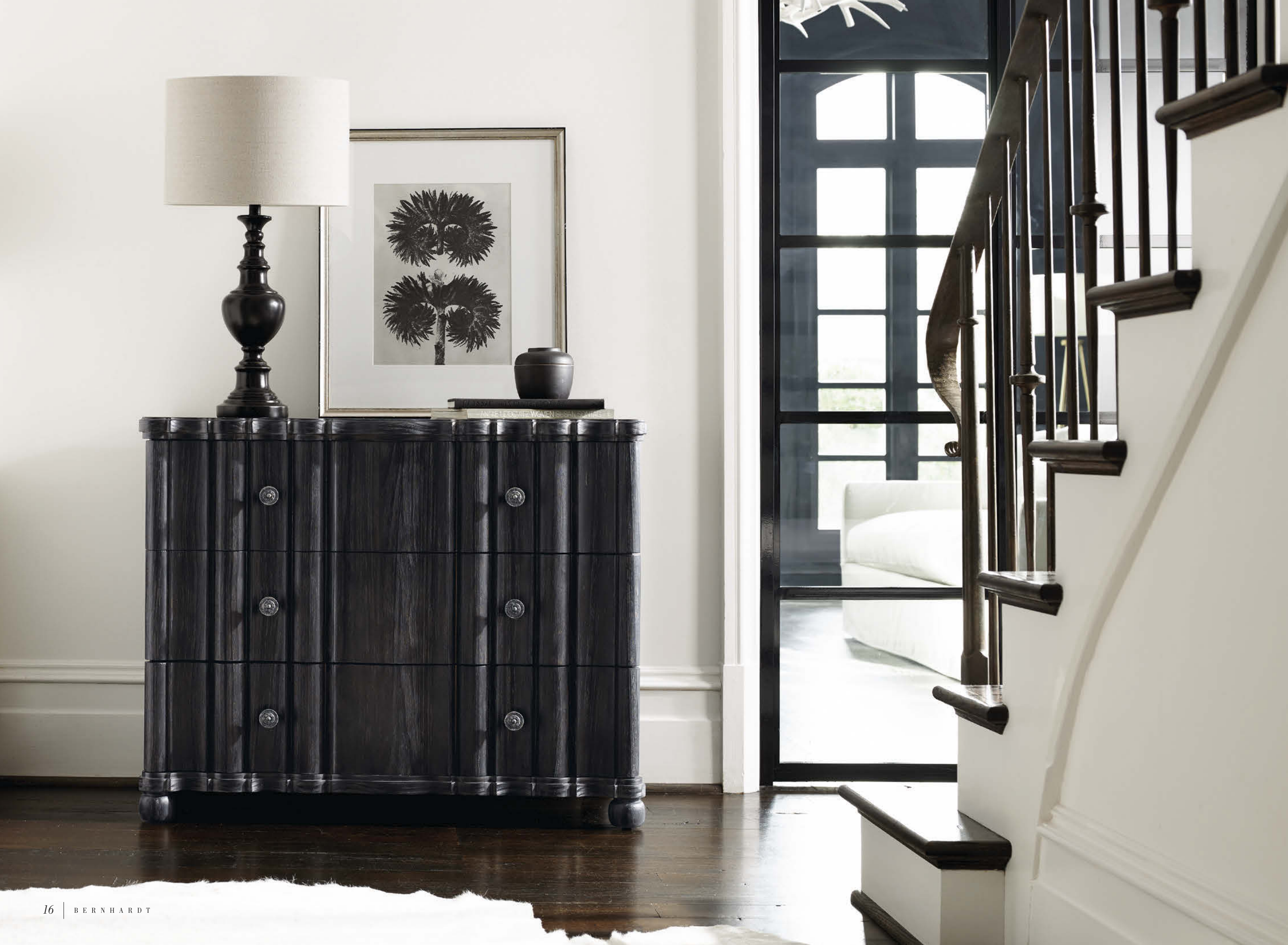
SHOWN: 304-032B Bachelor's Chest