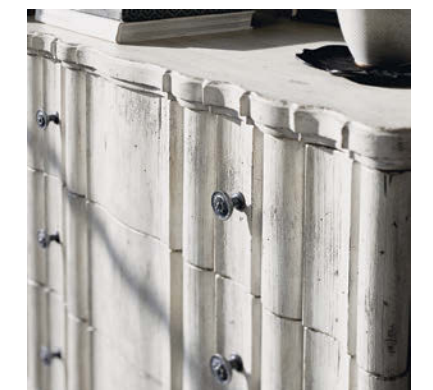
SHOWN: 304-032 Bachelor's Chest 304-125 Round Side Table N2062L Pascal Chairs ( Leather 209-000 )